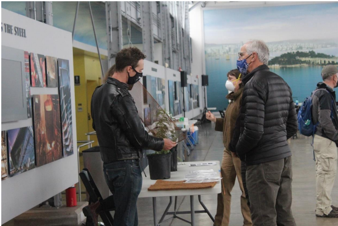
Demonstration station on competitive planting.