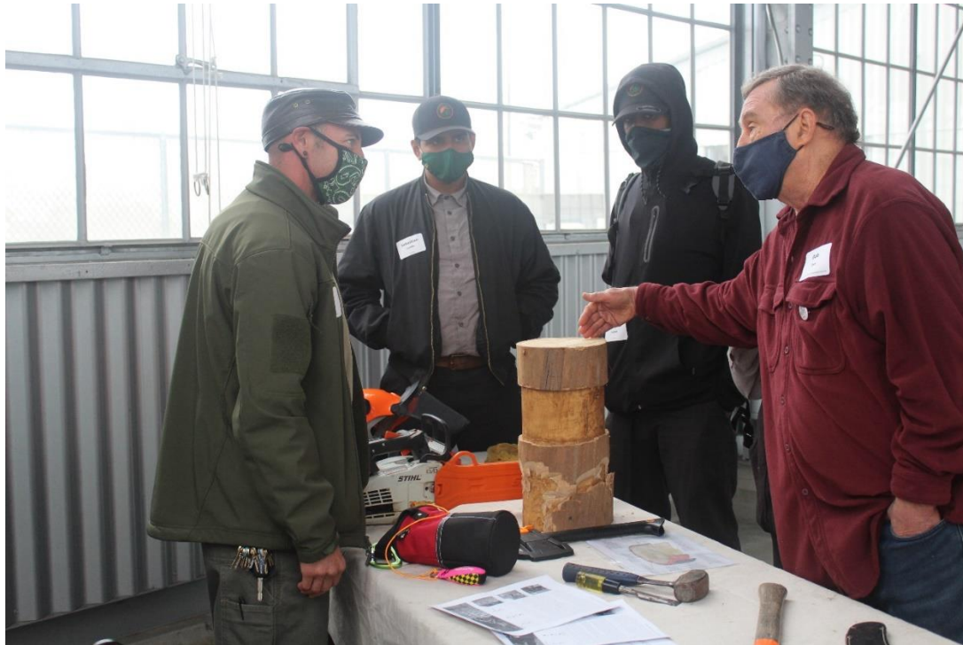
Demonstration station focusing on techniques for controlling invasive trees.