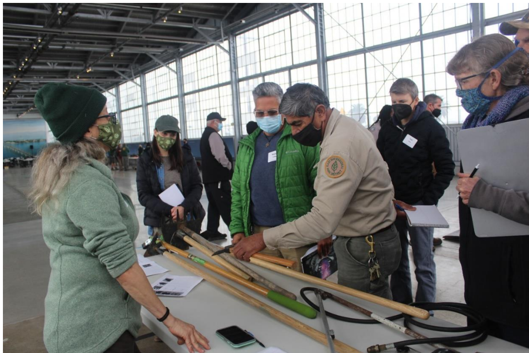
Demonstration station on flaming and hoeing to cope with carpets of invasive plant seedlings.