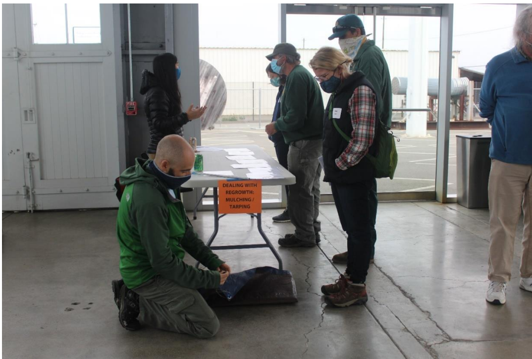
Demonstration station on mulching and tarping.