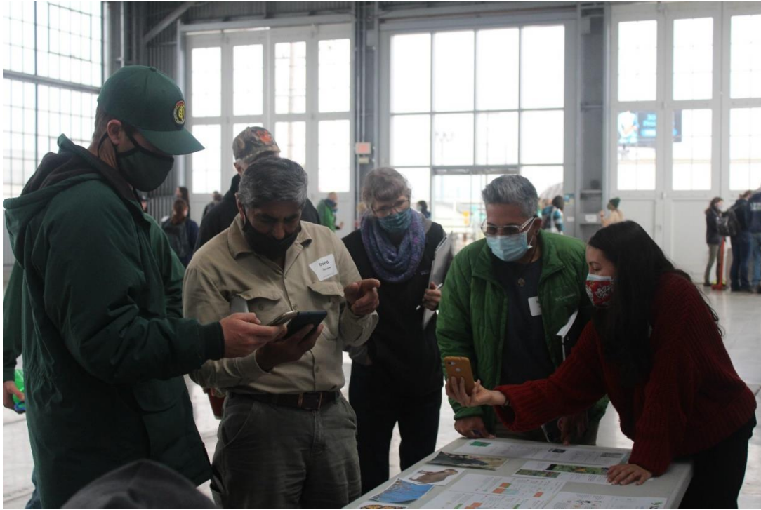
Demonstration station on mapping.