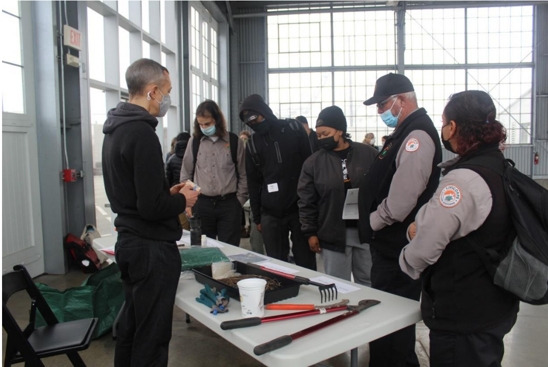
Demonstration station on dealing with vines.